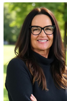
Lori Light, RI Ombudsman

In Rhode Island, all individuals are mandatory reporters of elder abuse, neglect, or exploitation. If you suspect abuse, you must report it to the Office of Healthy Aging. If you suspect abuse, neglect, and/or financial exploitation by a caregiver or self-neglect of an older person (60+) who resides in community call 401-462-0555 anytime.